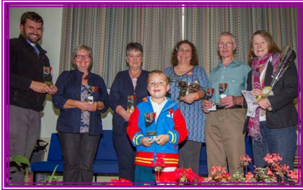
Some of this year's winners at the very first Barrhill Flower Show

2016 saw the very first Barrhill Flower Show held on Saturday 3rd September—with 68 different classes on offer. The day was so successful that next year's show is already in the planning stage, with lots more new classes and an electronic version of the schedule planned to make the show all the more accessible. One new class will be for a bottle of home-brewed Sloe Gin, so get picking before its too late and start making